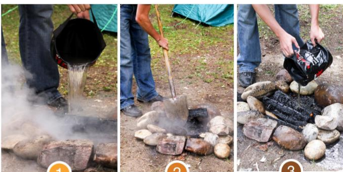
1 Soak it